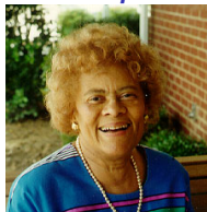
Evelyn Boyd Granville

second black woman we know of to earn a PhD in mathematics ...this was the most interesting job of my lifetime—to be a member of a group responsible for writing computer programs to track the paths of vehicles in space